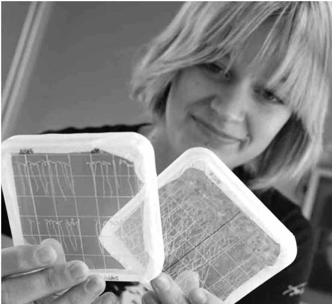
David Scherrer / WWU Publishing Services

Prereq: permission of thesis advisor. Research contributing to a graduate degree program. Graded "K" until thesis completed. Repeatable to a maximum of 36 credits. S/U grading.