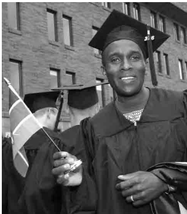
David Scherrer / WWU Publishing Services

All other nonmatriculated students should contact Extended Education and Summer Programs to explore other educational opportunities. Fee reductions and tuition waivers are not applicable to self-supporting extension courses. Students may elect to audit an extension course at full tuition if space is available.