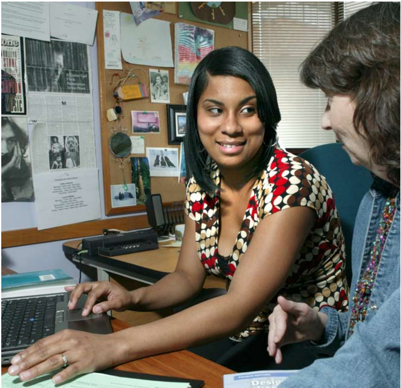
David Scherrer / WWU Publishing Services

Original research, including use of primary source materials and bibliographic aids, interpretation and/or textual criticism, and writing an original research thesis. May require a knowledge of auxiliary sciences, a foreign language, or the use of statistics or computer programming, depending on the topic of the research. Repeatable to a maximum of 12 credits.