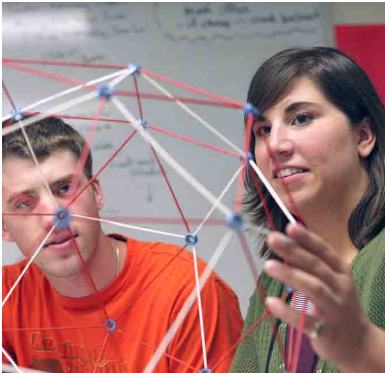
David Scherrer / WWU Publishing Services

Topics will vary somewhat with different instructors, but may include: Understanding the nature of science and what discriminates science from other ways of knowing. Discriminating among good science, junk science, and pseudoscience. Elementary statistics and how they can mislead. Logical fallacies. Scientific topics in the news (e.g., creationism vs. evolutionism)