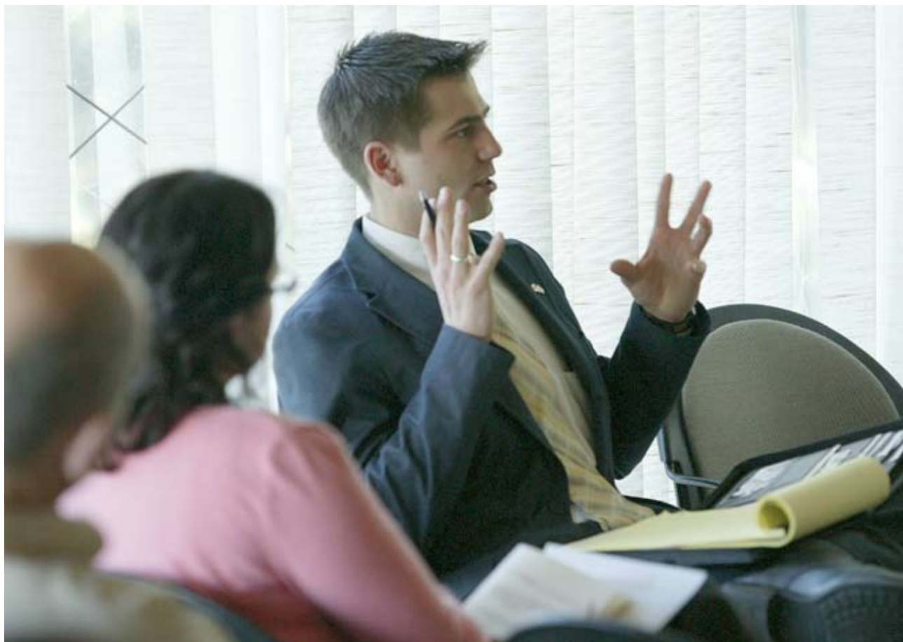
David Scherrer / WWU Publishing Services

Prereq: LING 201, 204 and the two upper-division core courses. Students selected for tutoring must dedicate four hours per week to provide help to other students, primarily those enrolled in LING 201 or LING 204. Permission may also be given to assist with other linguistics courses completed with outstanding achievement. Students may be requested to lead group sessions or work with students individually. Expertise in phonetics/phonology or morphology/syntax is desirable. S/U grading.